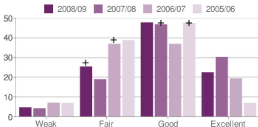
1. Quality of services